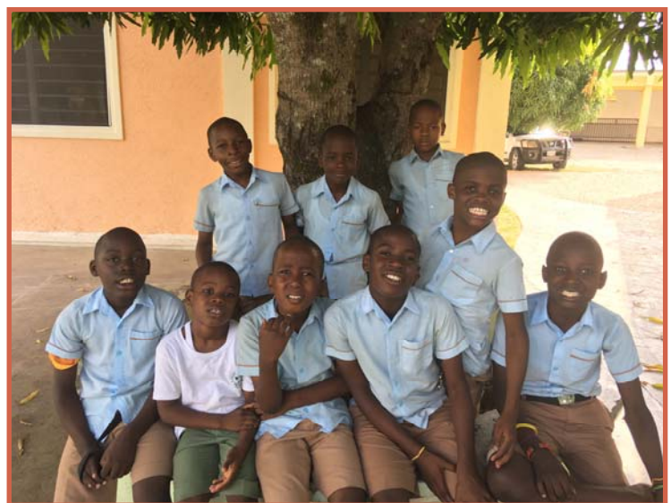
8 Boys and Babydson

Thank-you for selecting HCAS to be the beneficiary of memorial donations.